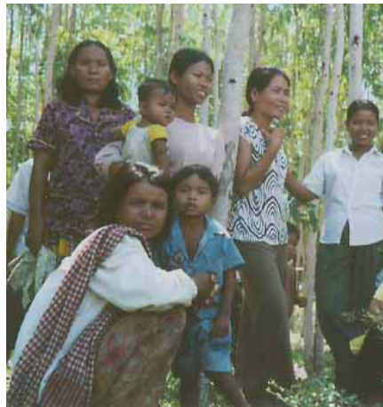
Women who attended the seminars.

official who is a Buddhist. Of the nearly 100 women in the audience, 75 had never been to a church meeting and were hearing the gospel and biblical teaching for the first time.