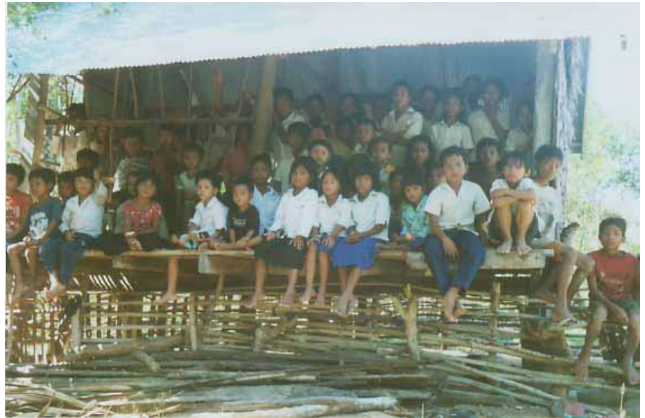
Village children who attended the children's ministry program.