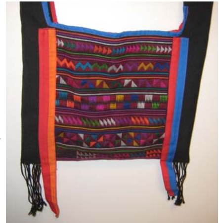
Colors may vary.