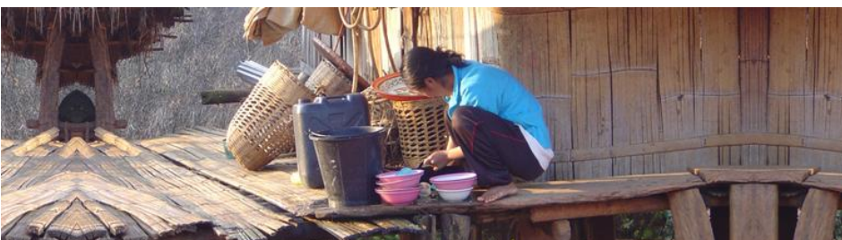
What's in this RMAB?