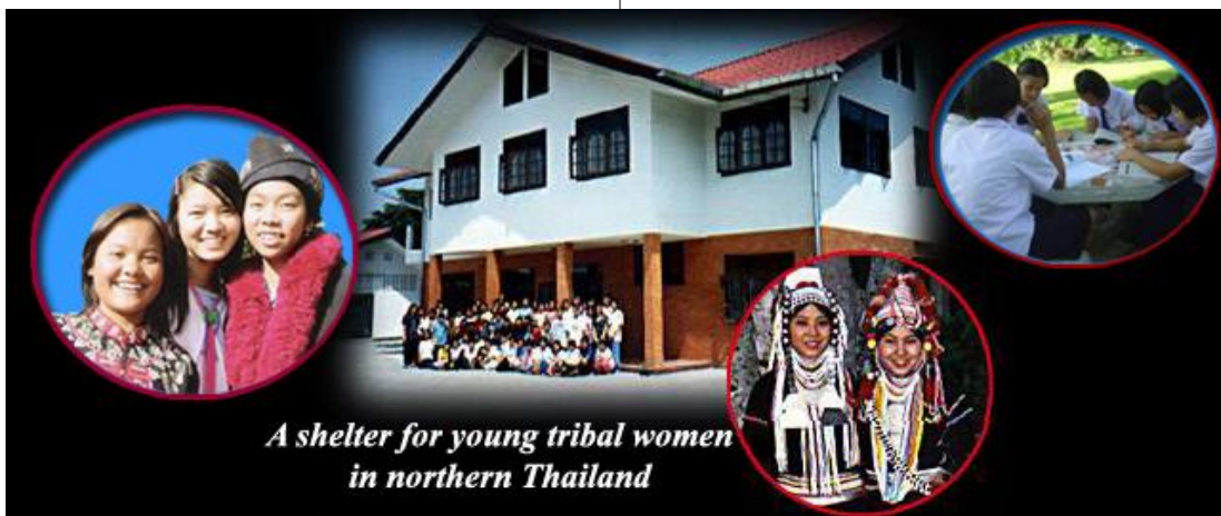
A shelter for young tribal women in northern Thailand

November 21, 2008 is the Deadline to Sign up for the February 2009 Mission Experience to Thailand Page 6