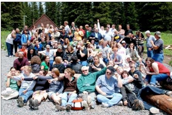
What's in this RMAB?

Sunshine throughout the three weeks provided opportunities for the campers to enjoy many outdoor activities