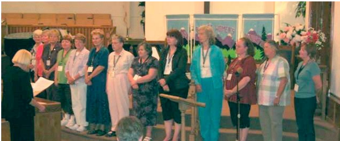
New Colorado State Officers and Board Members