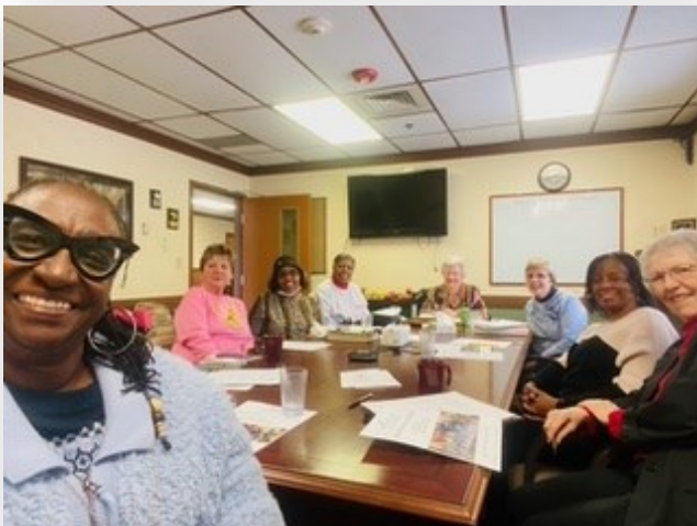
Colorado ABWM Board meeting - January 2024