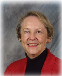
Anne Mills Scholarship Investment Chair