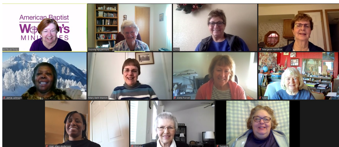
ABWM Board Zoom screenshot.